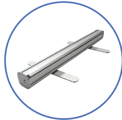
QTY 1: Good Roll Up Stand