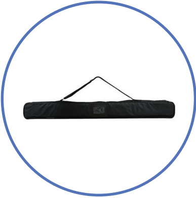
QTY 1: Travel Bag